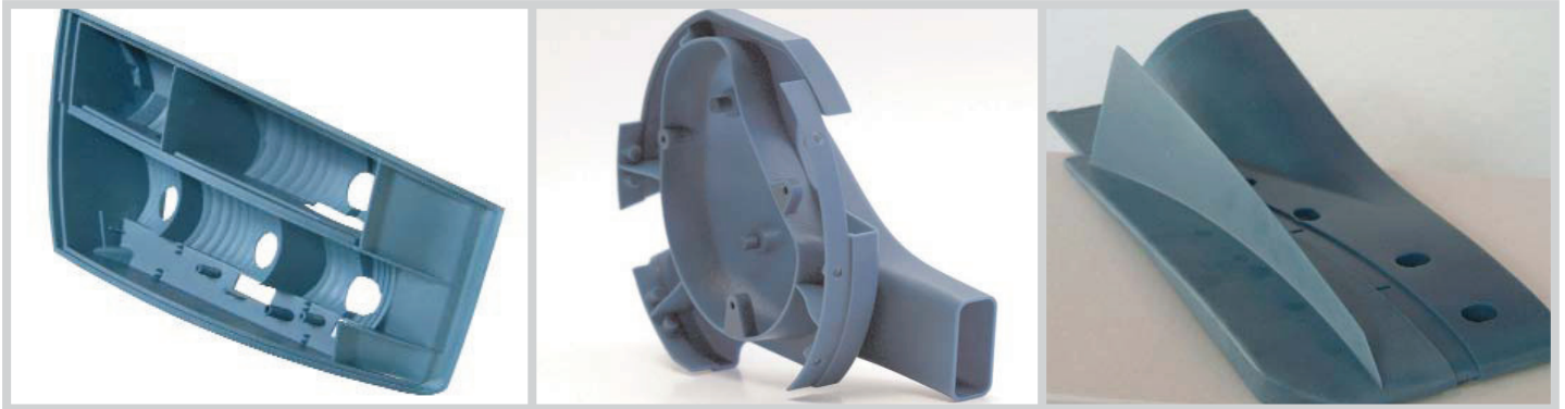
Aerodynamic and functional parts produced with Bluestone nano-composite plastic. Images (center and at right) courtesy of Renault F1 Team.

A high stiffness engineered nanocomposite that opens new applications for stereolithography users.