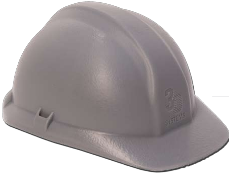
Functional prototype helmet used for durability testing

Get extreme performance and durability with Accura ® Xtreme Plastic.